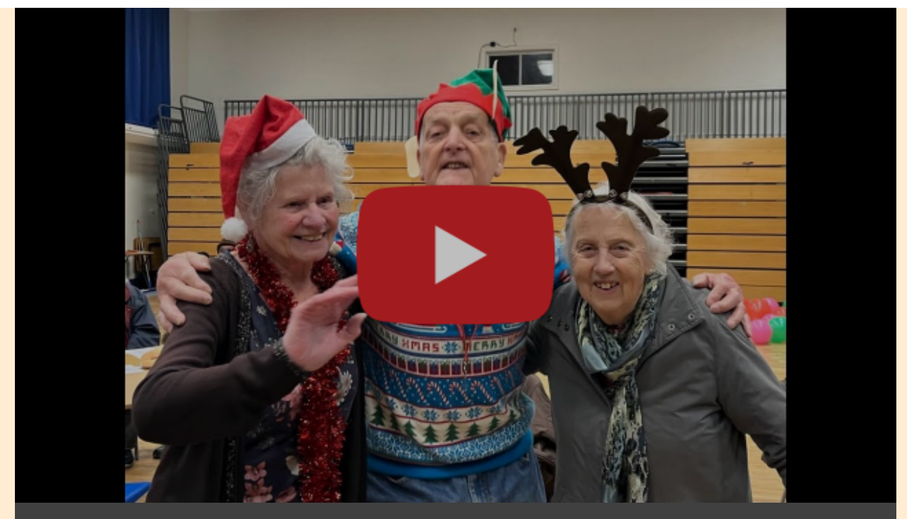
With particular thanks to The Hobson Charity whose grant has been instrumental in enabling us to provide free transport over the last 12 months.